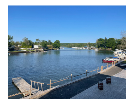
The Waterside Cafe Nourish your body and soul at the Waterside Cafe. Savor delicious and healthy food and beverages in a relaxing and serene environment by the water's edge.

Housed in historic buildings with elegantly designed interiors, the Waterside Spa is designed to create a sense of relaxation and harmony. Our friendly and attentive staff will guide you through a variety of wellness offerings including massages, facials, body treatments, manicures and pedicures. The spa features a range of amenities aimed at enhancing your experience: hot tub, lounge pool, cold plunge pool, sauna, fitness equipment, classes, relaxation areas and the Waterside Cafe.